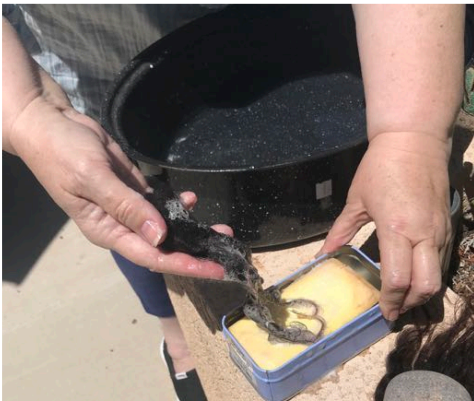
Rubbing a wet lock over a bar of soap to remove dirt and lanolin.