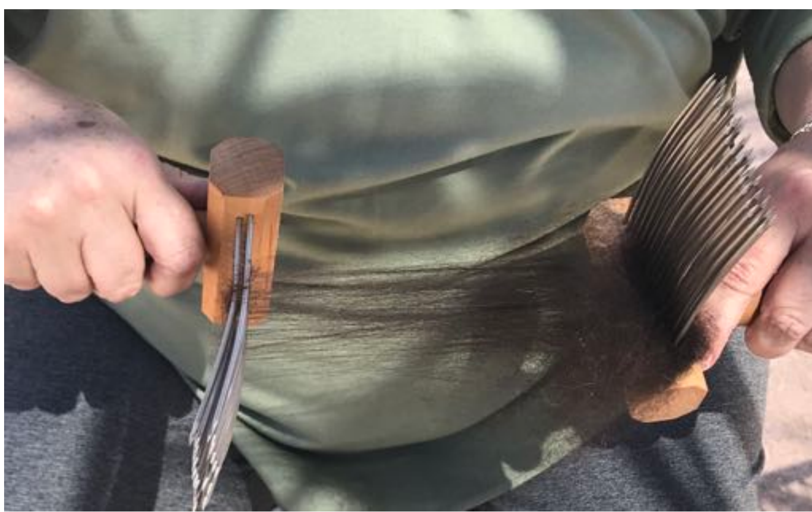
Combing locks to straighten individual fibers.