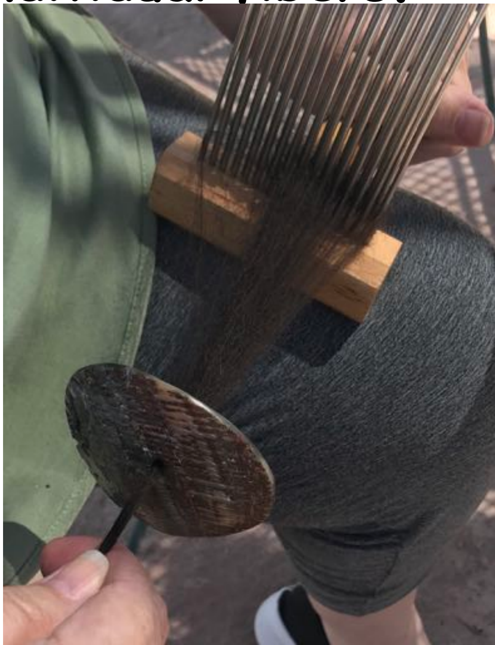
Pulling combed fiber through a diz.