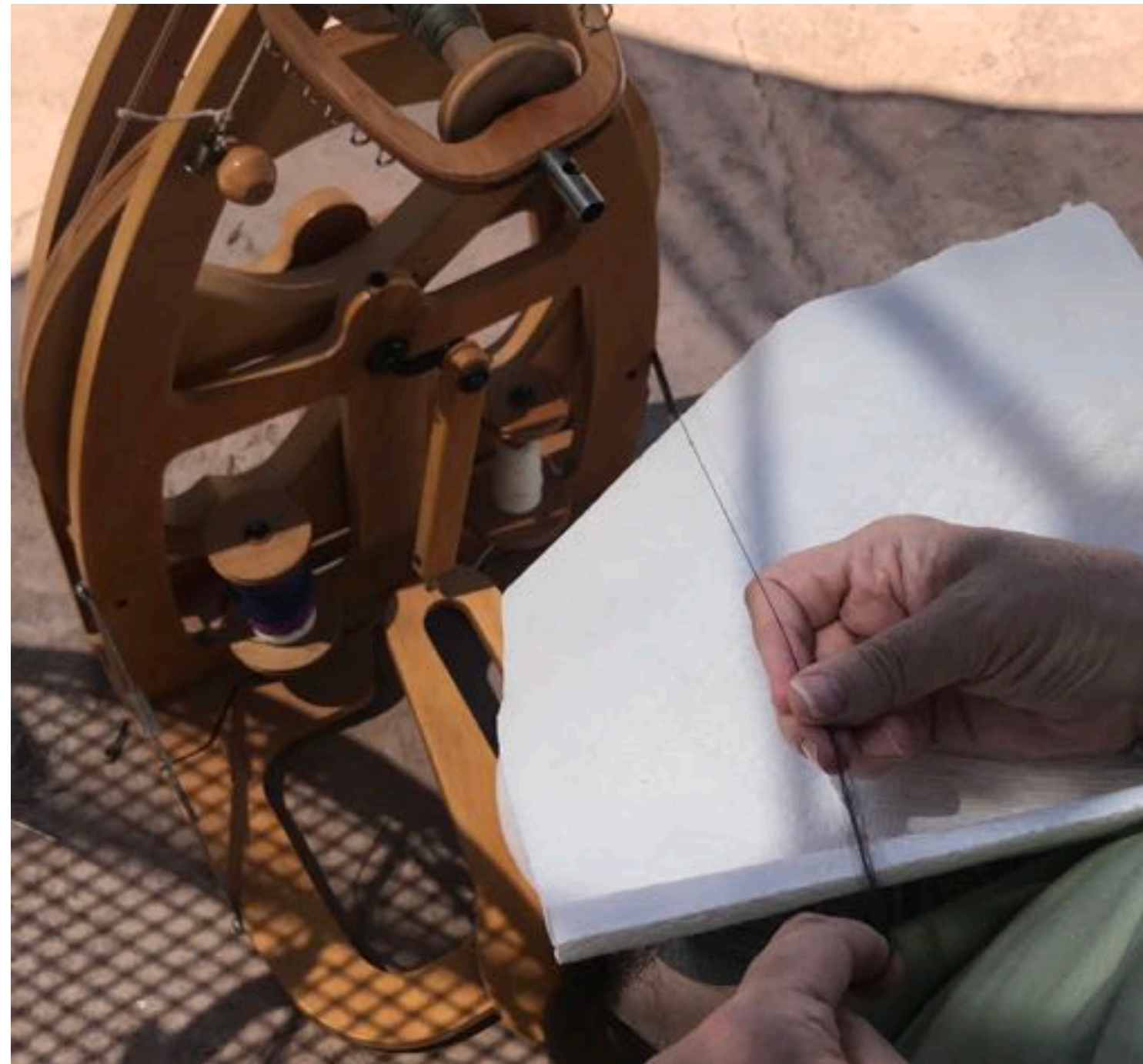
Spinning combed locks to make a twisted and strong yarn.