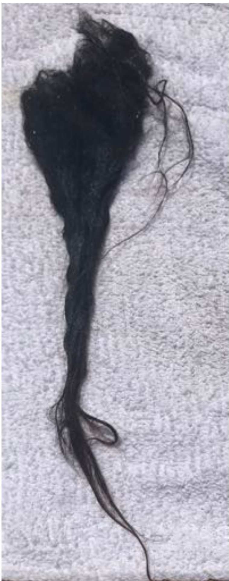
Unwashed lock of wool.