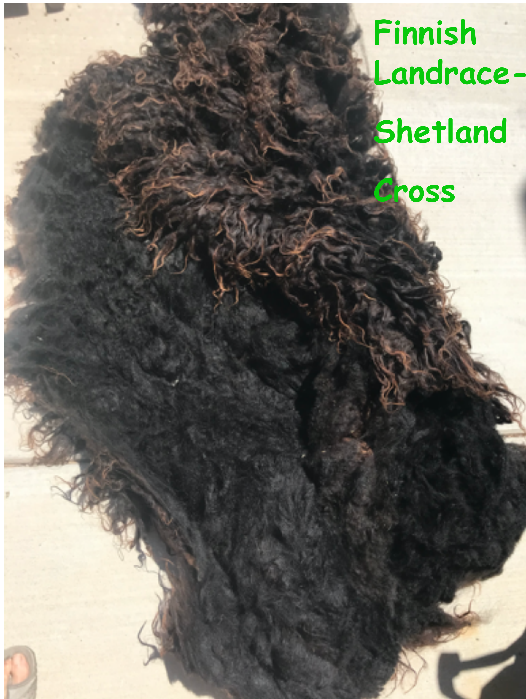
Finnish Landrace- Shetland Cross