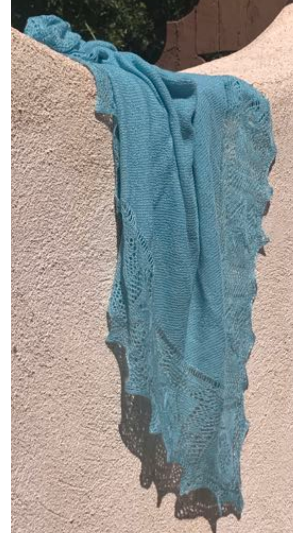
Knitted or woven articles of clothing.