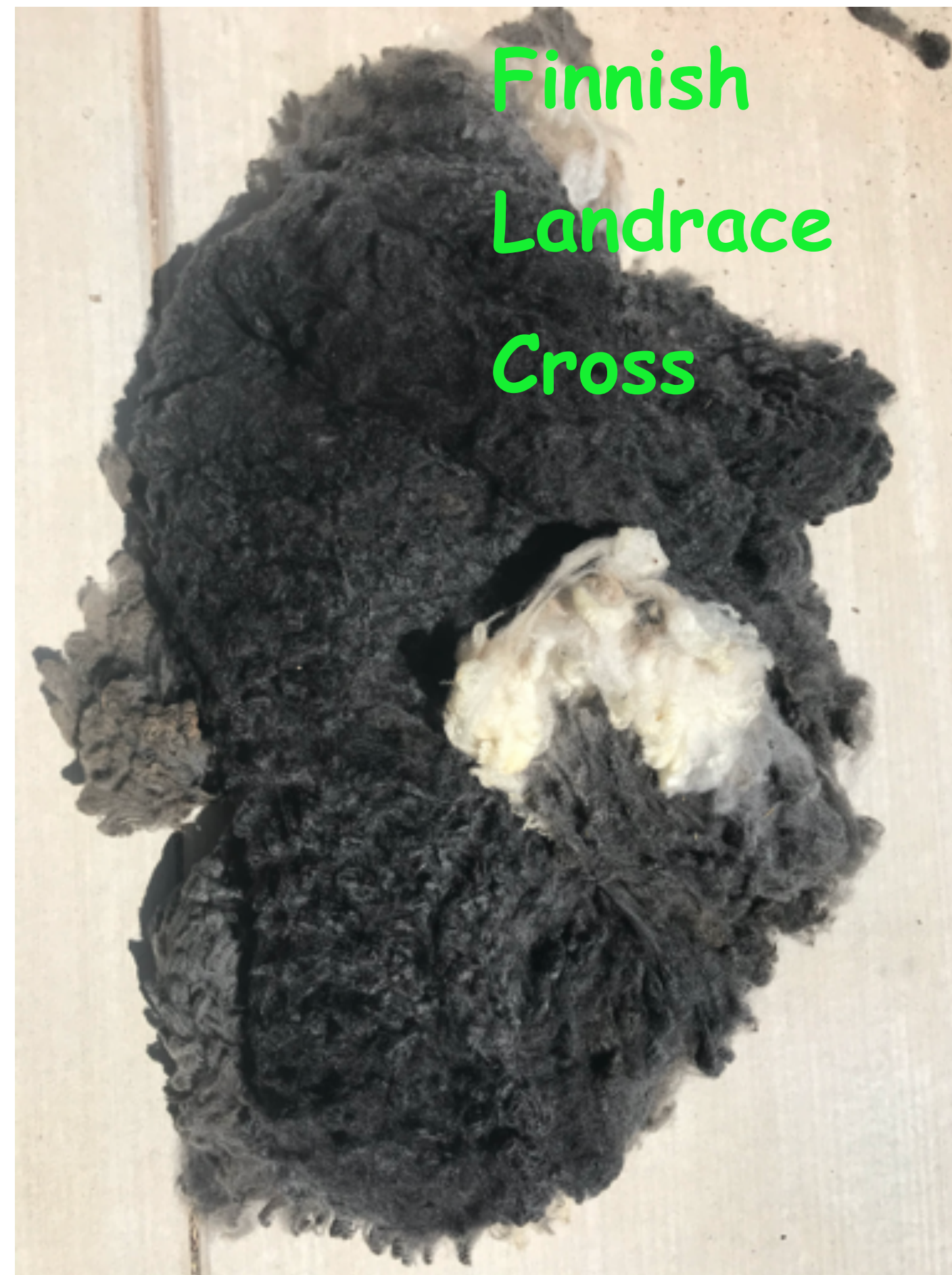
Finnish Landrace Cross