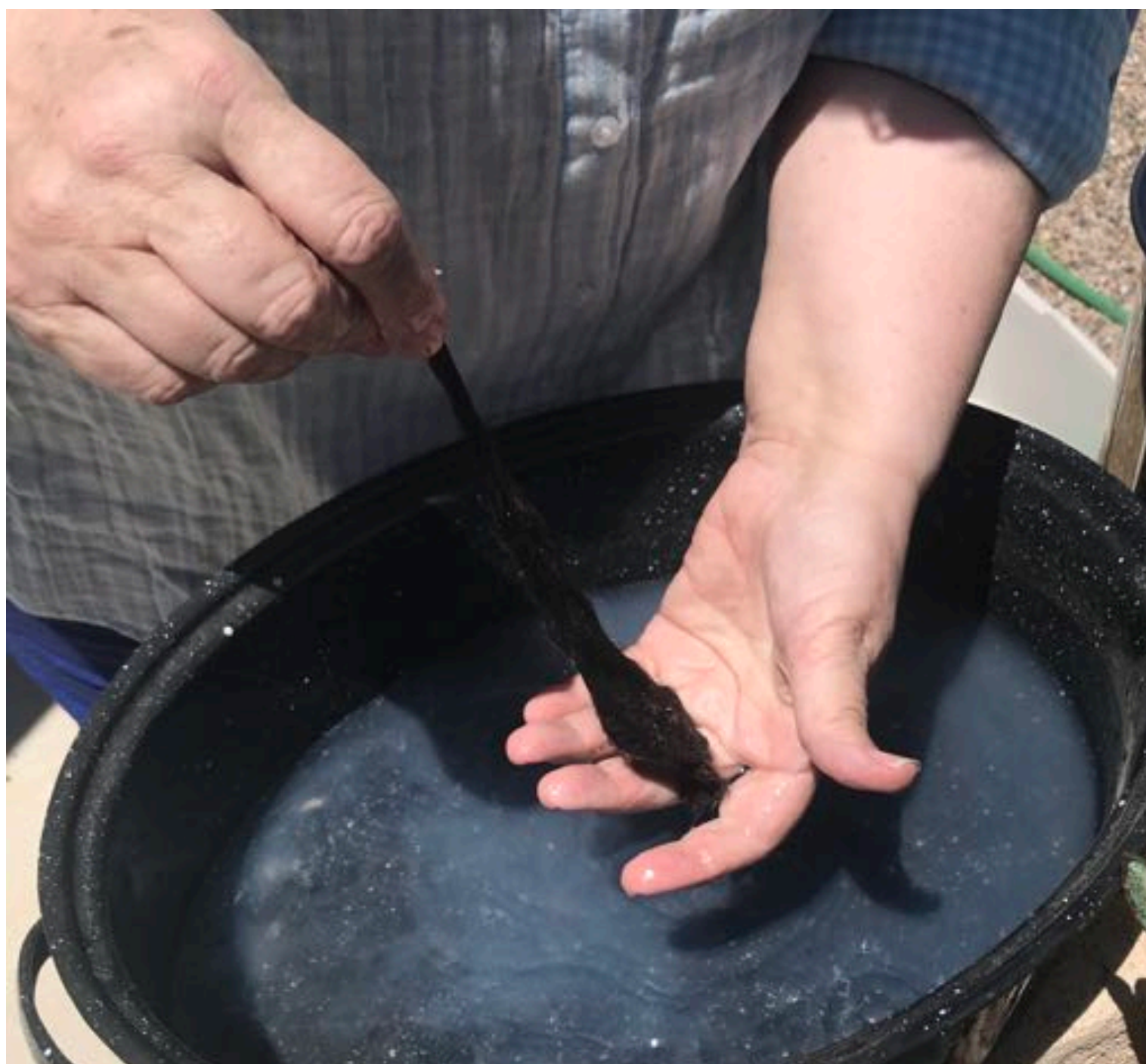
Rinsing wool in clear water.