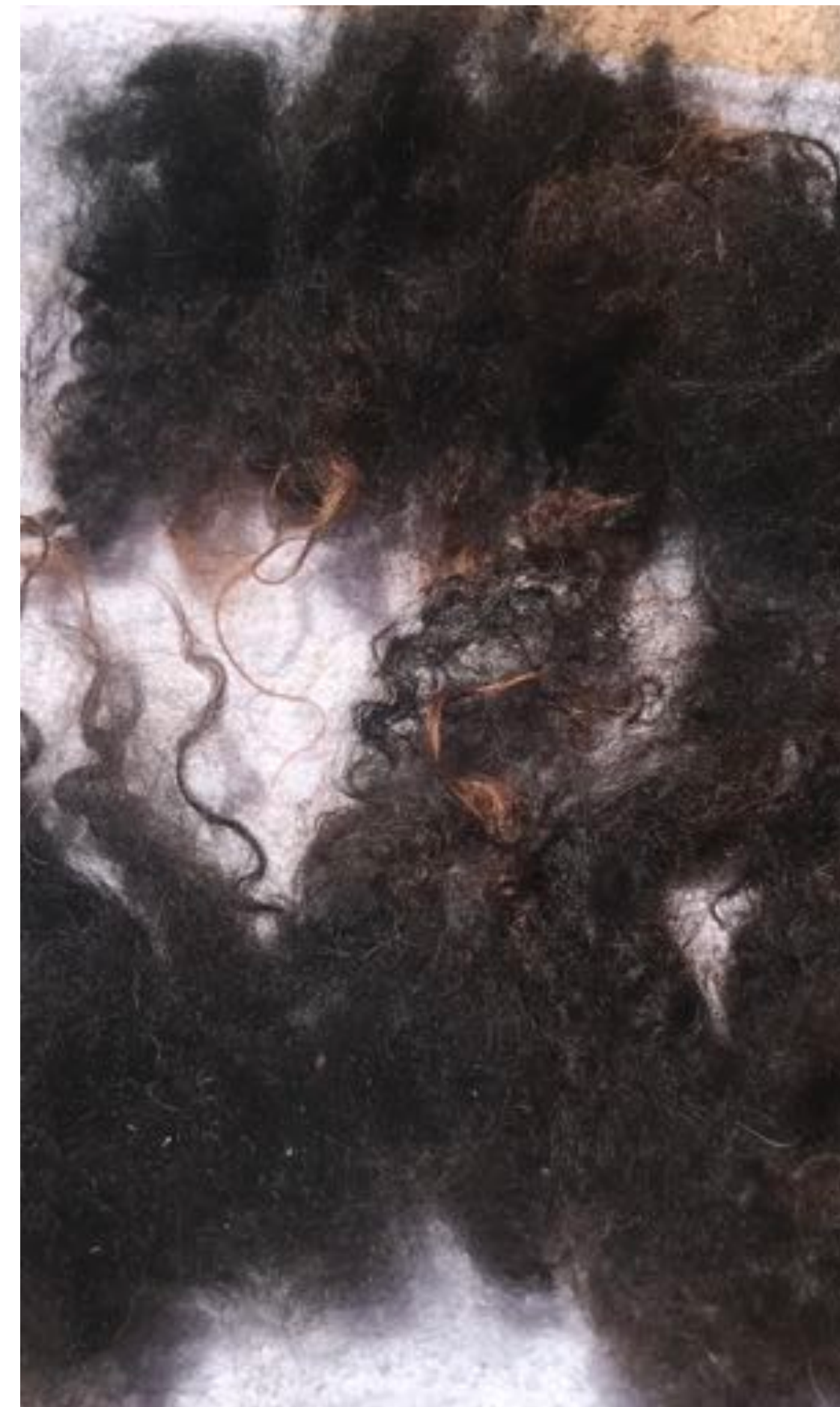
Clean, dry and fluffy locks.